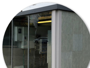
Fiberline lay light facade