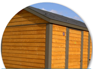
Wooden facade with pitched roof