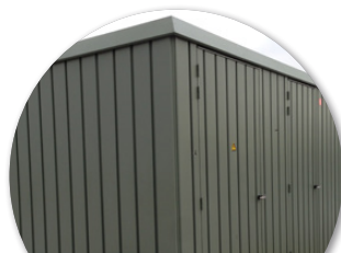
Zink Magnesium Facade