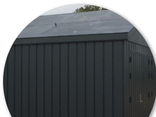
Zinc magnesium facade with pitched roof